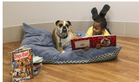
In August, Arlington Reads introduced a unique volunteer partner as part of the Reading Corps program - English Bulldog, Leroy Brown. Leroy Brown, famed pet therapy dog with Respect A Bull, Inc., shared his comfy pet pillow with youth as they curled up with good books and read stories to the attentive floppy eared listener.

Arlington Comprehensive Plan. An update is underway that will provide an integrated approach to all aspects of Arlington's development with an emphasis on developing attractive neighborhoods; having environmental and economic sustainability; and enhancing land use and transportation coordination. An Advisory Committee is assisting with this effort, and residents can discuss these issues on the City's Facebook page.