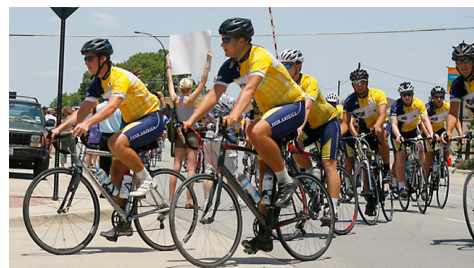
A team of cyclists participating in Journey of Hope, presented by KRG Capital, arrived in Arlington on July 12 as a stop on their 4,000-mile cycling event across the country to raise funds and awareness for people with disabilities. This summer marks the 17th consecutive year the City of Arlington will host a team of cyclists from Pi Kappa Phi fraternity. The team cycles an average of 75 miles per day and began the journey in Seattle and San Francisco. The event ended in Washington, D.C., on August 10.