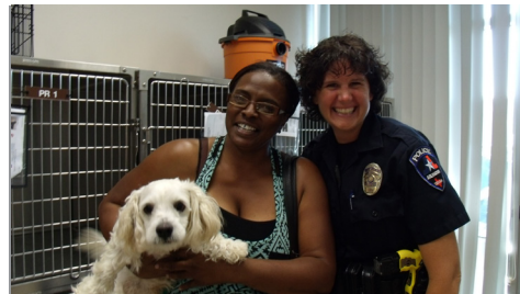
After a social media campaign by the Arlington Police Department (APD) and the Animal Services staff on Facebook and Twitter, the lost dog Chubby was reunited with his family. APD regularly posts content on Facebook, Twitter, YouTube, and Nixle. Social media enables the community to become a vital part of the APD team. More details are in the story on this page.