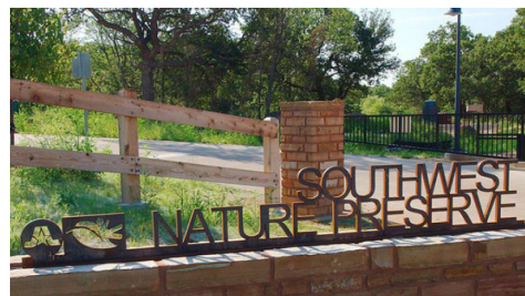
The 58-acre Southwest Nature Preserve, located at 5201 Bowman Springs Road, is officially open for business. Gates are open from 5:00 a.m. – 10:00 p.m. Recent improvements to the park included a boardwalk into a pond for fishing, a small amphitheater for educational programs, parking, and picnic areas.